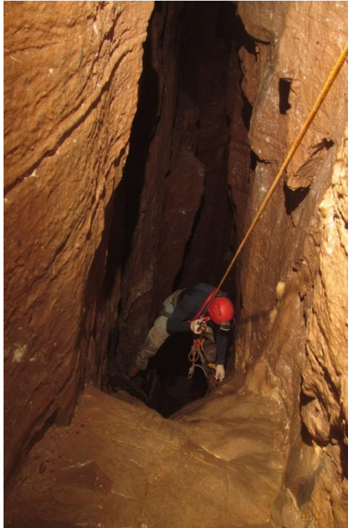
calcite slope, caver's left hand on lower ring bolt

A small handful of trips later, a number of resin anchors had been installed, mostly down the right hand wall and then a single one in the left wall to better enable a nice Y-hang across the top of the vertical section. A deviation is available a little way down the pitch to enable the caver to hang clear of the small amounts of water which sometimes come down the crack line beneath the original lower ring bolt. The deviation cord and karabiner are fitted to stay there – just as with the deviation on the first pitch at The Nave.