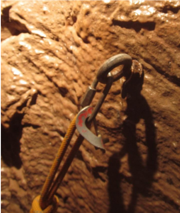
upper ring bolt

Back in August, a request arose for the bolts on the Columns pitch to be replaced with resin anchors and adopted as official SWCC maintained fixed aids. In its previous configuration there was a big lump of rock forming a natural belay from which a short traverse leg to one big ring bolt gave access to a calcite slide sloping a few metres down to a second big ring bolt with a big delta maillon stuck on it.