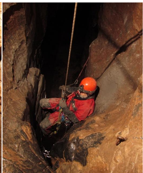
traverse line, Y-hang and upper pitch, deviation visible behind caver