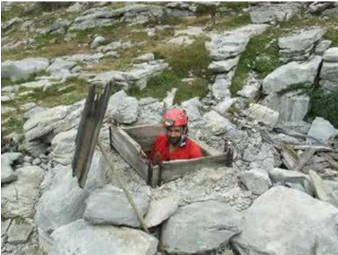
For those who may not be aware the literal translation of ‘Tete Sauvage’ from French into Welsh would be ‘Penwyllt’.

The Objective of the expedition is to allow as many participants as feel able to make traverses of the Pierre Saint Martin System via both the Tete Sauvage and the SC3 entrances and also to facilitate exploration of the lower part of the system by access through the EDF tunnel. In order to facilitate this objective both entrances will be hard rigged so that traversing parties do not need to carry large quantities of rope thus making the traverse faster, safer and more enjoyable.